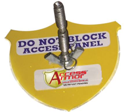
FIRE HOLD DOWN SHIELD

Custom sizes/designs are also available. Please contact Access Doors And Panels for more information.