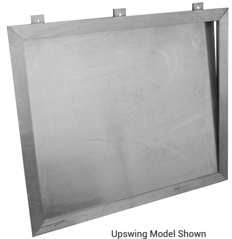
Upswing Model Shown