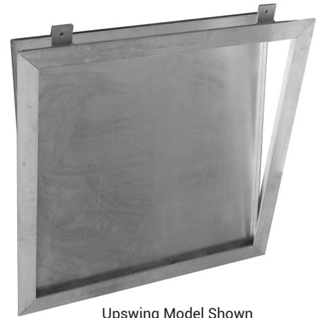
Upswing Model Shown