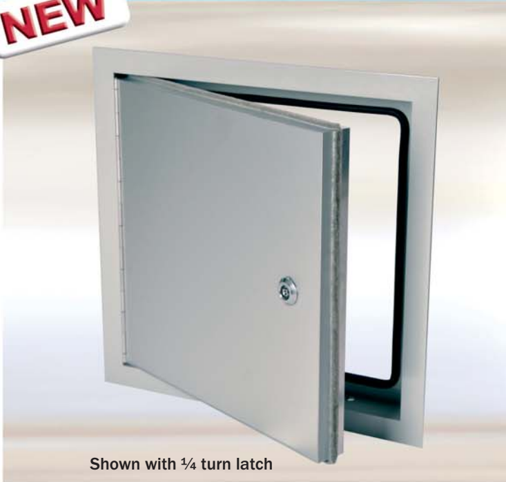
Shown with ¼ turn latch