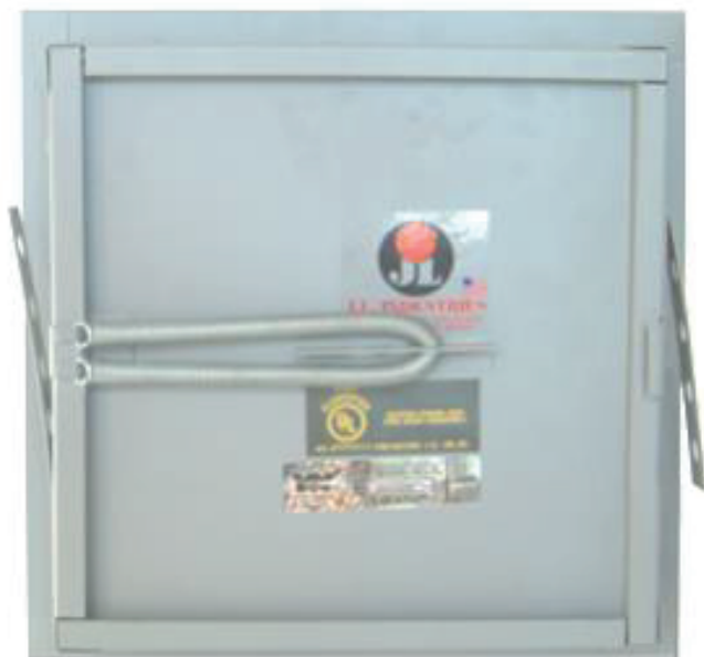
SPRING-ASSISTED CLOSING OF FD PANELS

JL Industries' innovative line of fire-rated access panels for every type of installation meets testing standards: UL10B, CAN/ULC-S104, ASTM E152. Access panels are rated to 1-1/2 hours for 2 hour fire barriers for vertical surfaces in sizes up to 48" x 48" (24" x 48" for Heavy Gauge). All models feature a 2" thick insulated door, slam latch with spring-assisted closer and welded on masonry anchors. Minimum size 8" x 8".