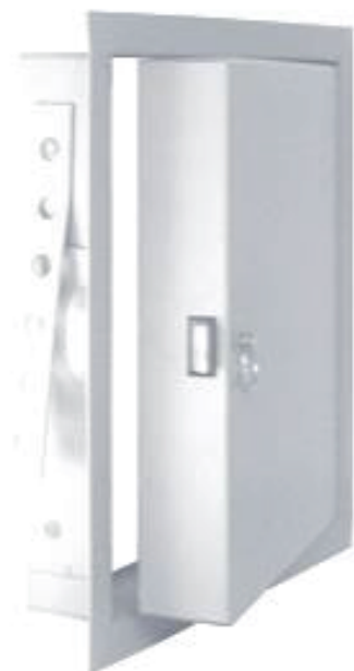
DETAIL OF WALL MODEL