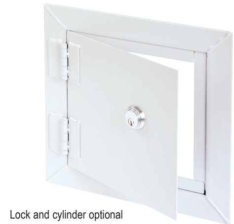
Lock and cylinder optional